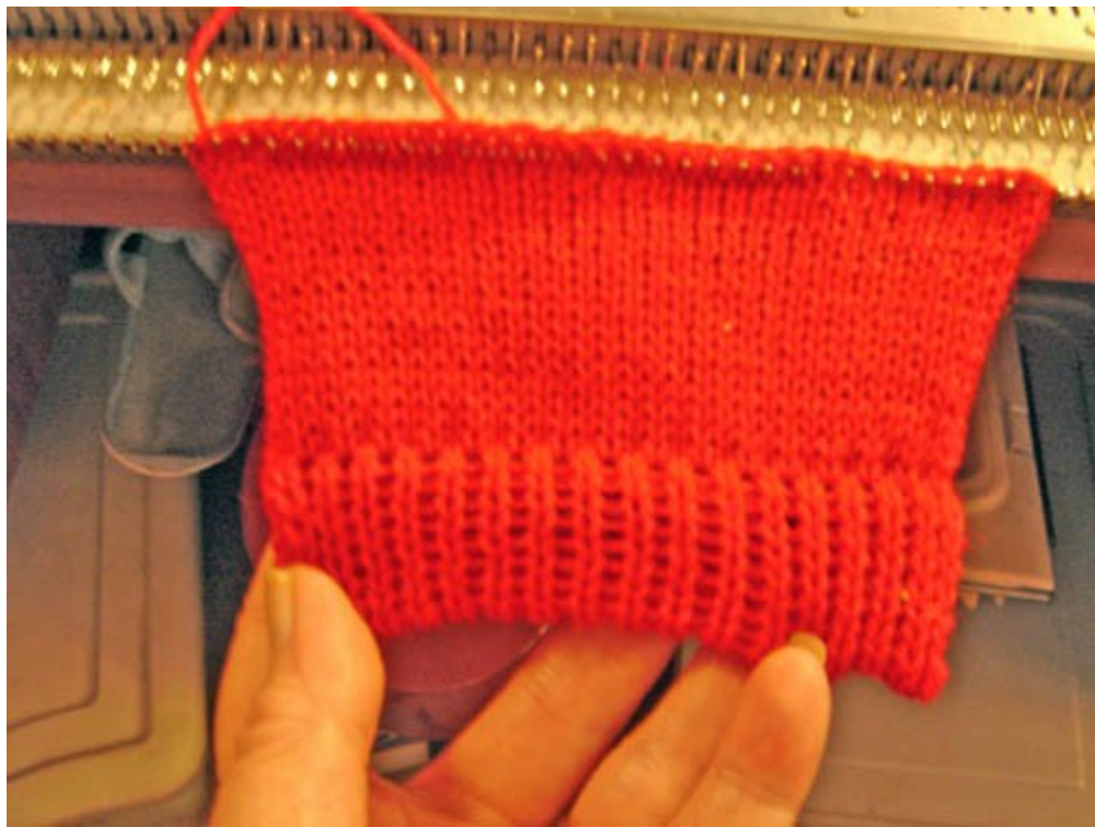
Mock Rib stretched out a little.